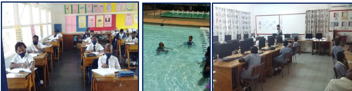
Happy to be back in school! - Grade 4D Class, ECD Swimming Lesson and Grade 3C revising their ICT work.